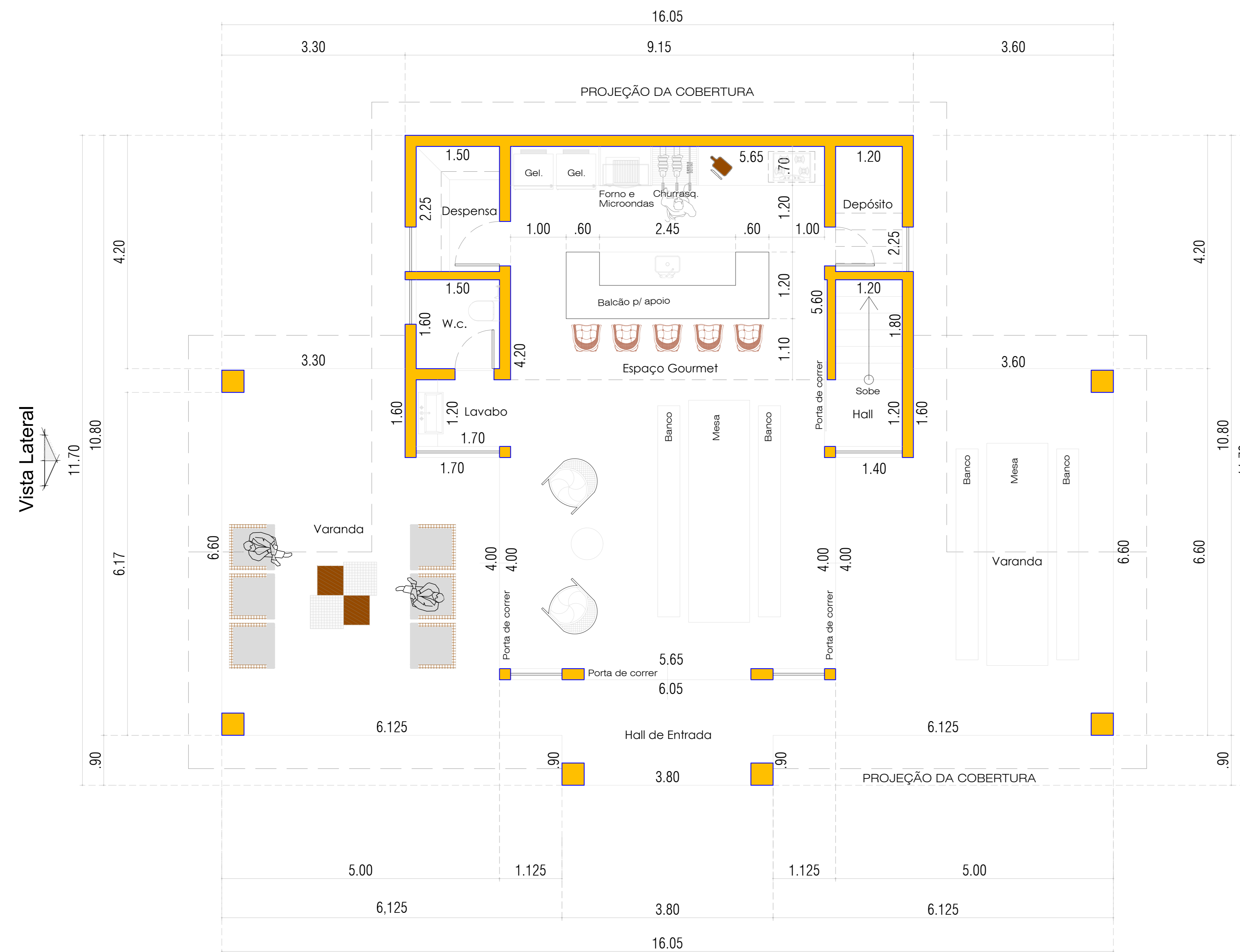
Planta Baixa - Espaço Gourmet Escala 1/50